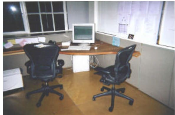
Figure 1 A pair programming station. The Chekhov board is immediately to the right of this picture.

(See Figure 1.) This pair programming area was divided informally into two sections. The area showed few signs of personalising the workspace. The wall had a notice board which contained, amongst other things, a large organised area devoted to 6" by 4" index cards — the active story cards. Each card had a coloured sticker on it denoting its status, e.g. red to denote unfinished story, yellow to denote developer finished story, and so on. There were also four 'to-do' lists which occupied a prominent position and two of the lists had at its top a picture — one of Anton Chekhov and the other of Pavel Chekhov 1 . These 'to do' lists were checked-off to signal certain events. This part of the wall was a 'busy' area in contrast to the rest of the walls which were generally quite bare. This area is also where a daily meeting took place — known as the stand-up, since people did not sit down at such meetings. These meetings took place at the start of each day and were very short. One of the 'to-do' lists (the 'Standup Chekov') stated that 15 minutes was the maximum length. These meetings were the occasion when people chose what work they would do that day: who they would pair program with and the stories they would work on.